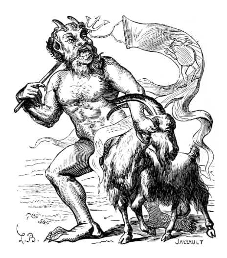
Figure 2 Azazel with a demonic goat

Throughout the medieval period, Azazel becomes firmly identified as a demon in the various hierarchies of angels. Numerous grimoires include Azazel in their rankings of the most important demons.