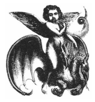
Figure 2 Eighteenth Century woodcut featuring Valac

Valac makes an appearance in the early nineteenth century as being the inspiration behind the Reign of Terror in France from June 1793 until July 1794.